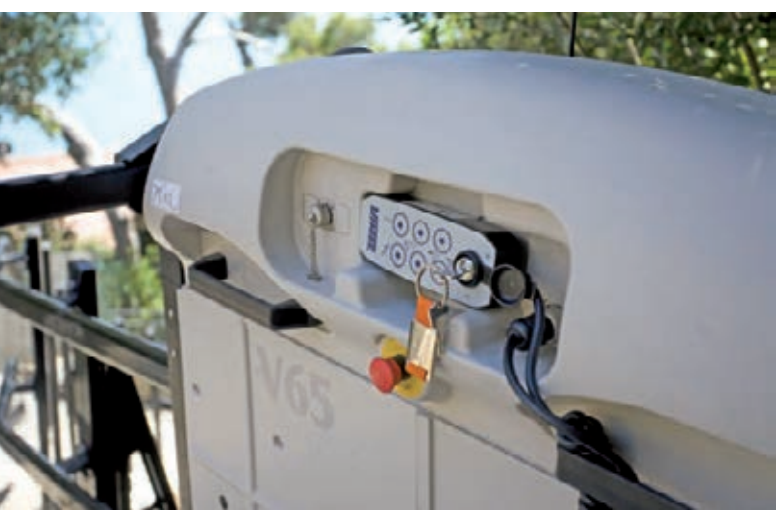
The V65 is able to tackle constant or variable gradients, adapting to the incline variation of a landing or flight of stairs.